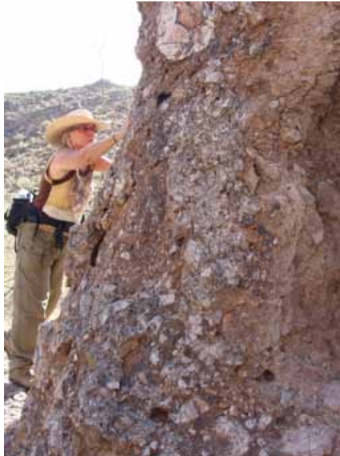
Teachers participating in PRI's Real Earth Inquiry project explore ancient lava flows at Craters of the Moon (top) and the volcanic history of Arizona's Superstition Mountains.