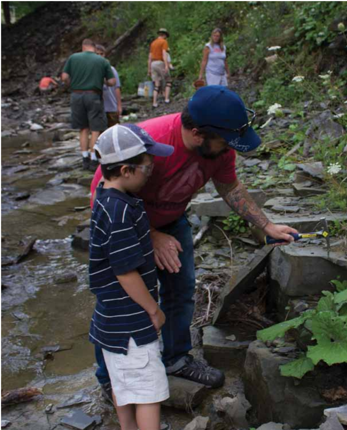
• A father and son enjoy exploring the ancient seas of Central New York on a PRI fossil collecting field trip.